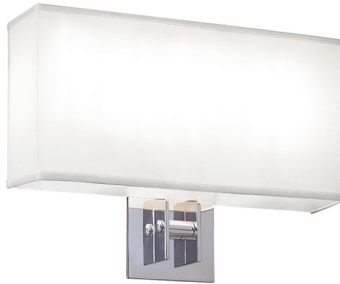
Madison Ave 2 Light Sconce MAD2-WM-PA-CS