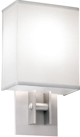
Madison Ave Single Sconce MAD1-WM-BA-CS